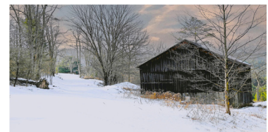
Before & After ©Karen Mitcheltree