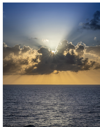
Before & After