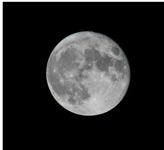
Corn Moon