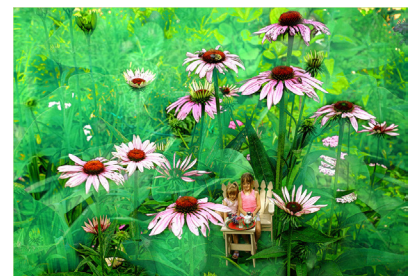
My "B" Photograph from 2014