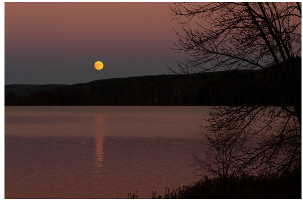
Moon over Cowanesque Lake