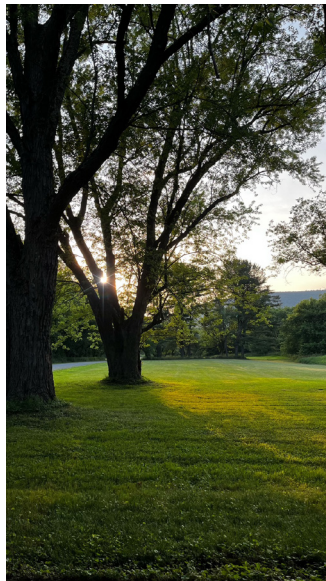
July Mill Cove Outing