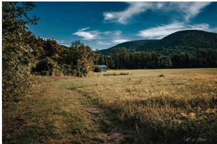
2 Images ©Mike Pizzo