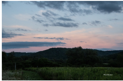
2 Images