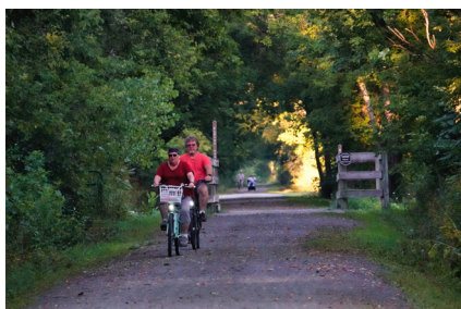
2 Images ©Linda Stager