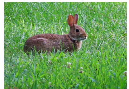
2 Images