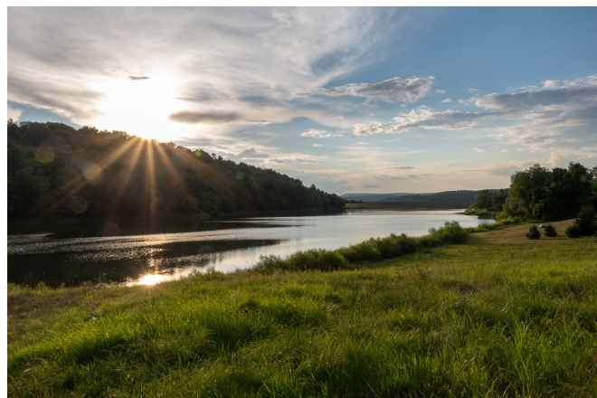
Hammond Lake Sunset