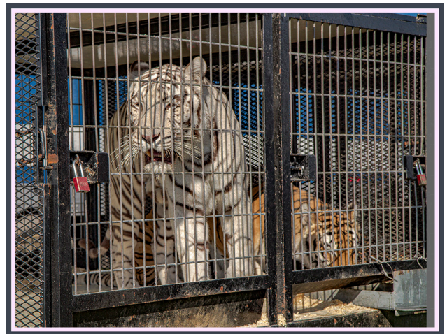
All images on this page ©Dwaine Gipe