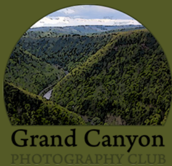
Image of the Month