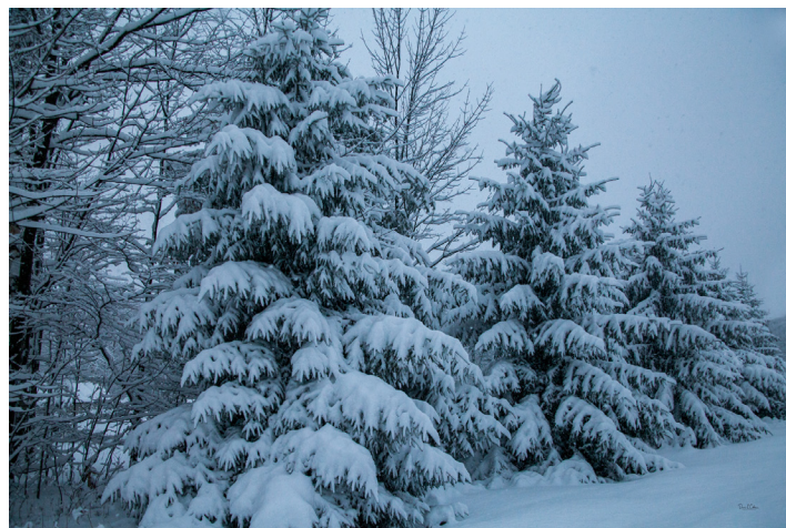
All Images This Page ©Diane Cobourn

As of right now, we are still on for our photo show in August 2021. I will be working with the officers and board to move forward with that. I will send