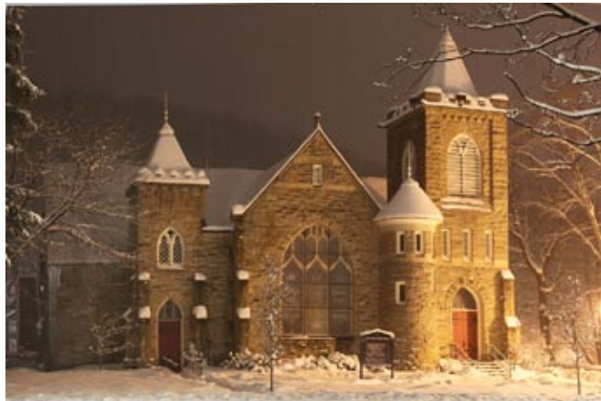
Snow Showers