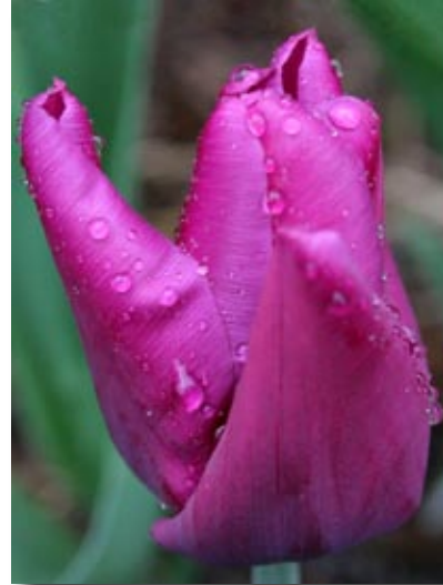
After the Rain