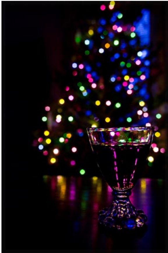
Christmas Bokeh